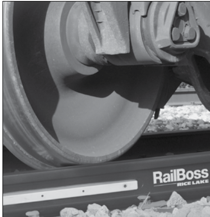
* Non Legal for Trade